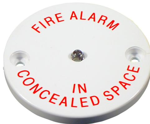
Remote Indicator – RMINDICS Fire Alarm In Concealed Space

Pertronic Industries offer remote indicators which are designed for fire detection systems where local indication of an individual or group of detection devices in concealed areas. Featuring easy connect terminal strip, they can be customised for many uses. The remote indicators can be used in variety of locations such as plant rooms, plant equipment, void spaces, cupboards, lift shafts and other concealed locations.