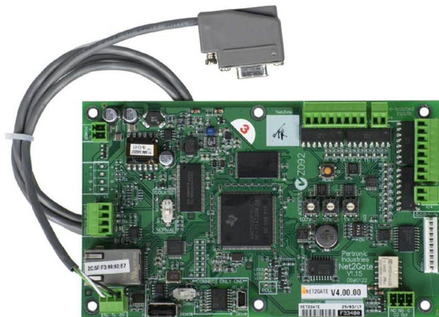
Ethernet Gateway Card Mk2 (NET2GATE)

16 digital inputs are available to interface with other equipment, such as Pertronic or third party conventional fire alarm control panels to signal multiple event types to the Pertronic FireMap graphics system.