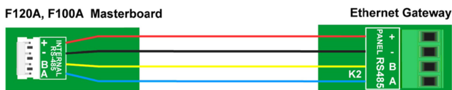
Typical RS485 Wiring Connection to Pertronic AA Control Panel