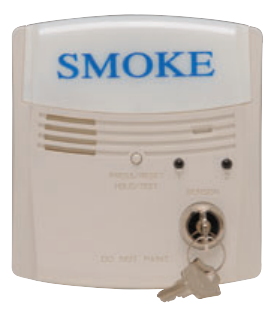
RTS2-AOS UL S2522