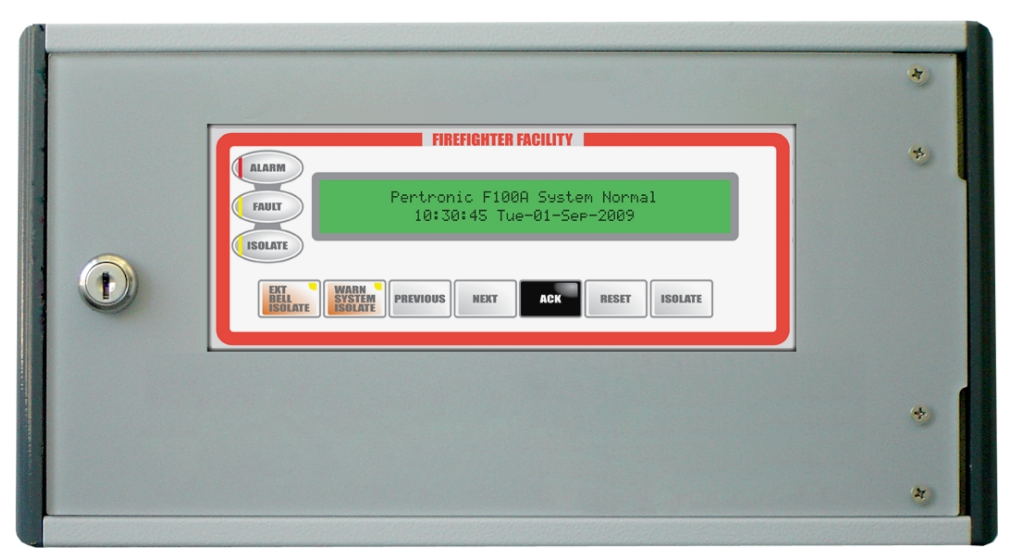
F100A LCD Mimic

Additional devices may be connected to the F100A's RS485 bus, but these will not be monitored.