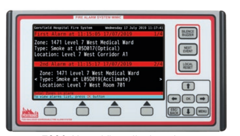
F220 Alarm View displayed on an F220 Enhanced Mini-Mimic

The F220 and Net2 Enhanced Mini-Mimics are capable of accessing all system event information, including faults (defects), pre-alarms, and disablements (isolations).