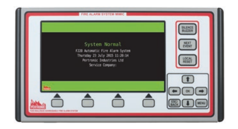
F220 Enhanced Mini-Mimic / Net2 Enhanced Mini-Mimic