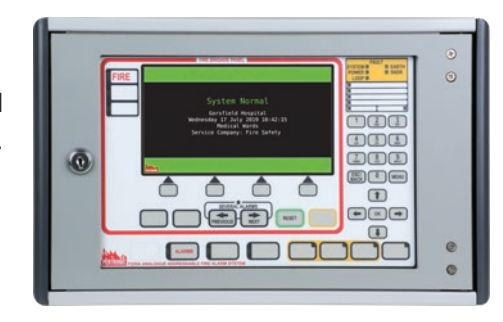
F220 Full Function Mimic / Net2 Network Control Unit