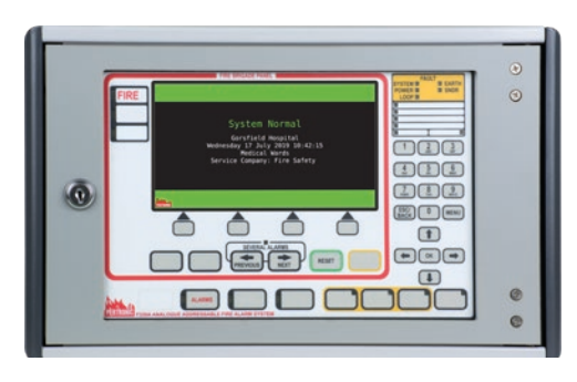
Pertronic F220 Full Function Mimic. When fitted with Net2 network firmware, this unit becomes the Pertronic Net2 Network Control Unit

All Pertronic F220 & Net2 LCD Mimics have the same 7 inch colour LCD display used on the F220 fire panel. The coloured display screens clearly identify the panel status. Red status bars and large easy to read text descriptors identify the Alarm mode.