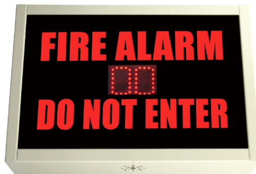
Audio-Visual Sign with Countdown Timer (AVS-C) fitted with Fascia AVDC-FADNE-R

Optional Fascia panels provide a range of visual warning messages.