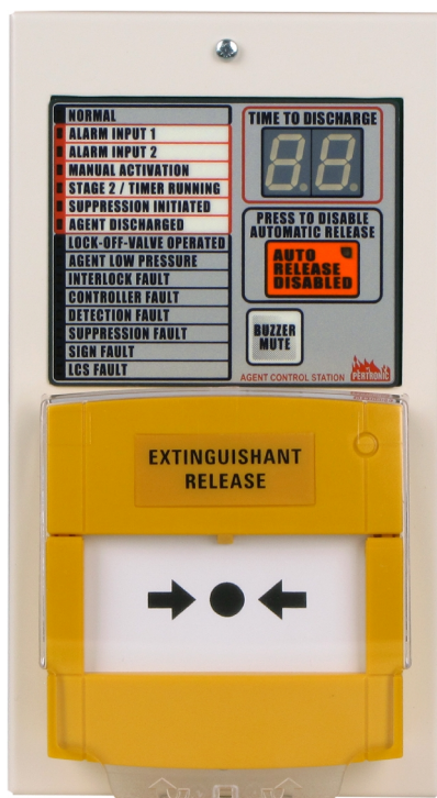
Agent Control Station (ACS)

The Local Control Station (LCS) provides full access to the Extinguishing Agent Release system, including the Auto Release Disable control, with reduced access to status information. It is suitable for local staff monitoring and responding to the Extinguishing Agent Release system.