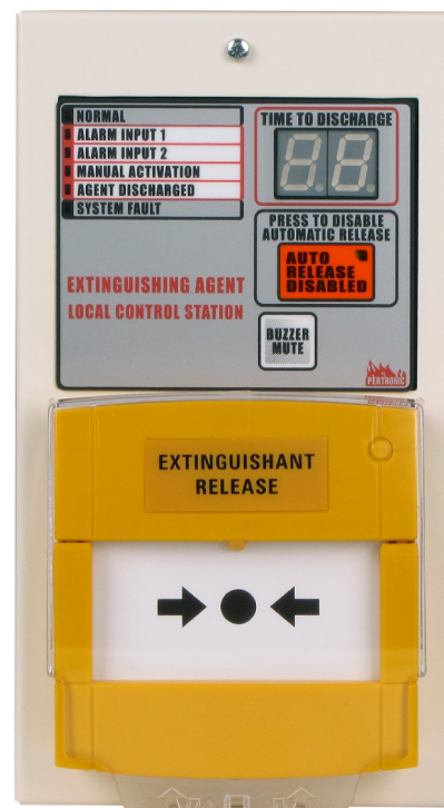
Local Control Station (LCS)