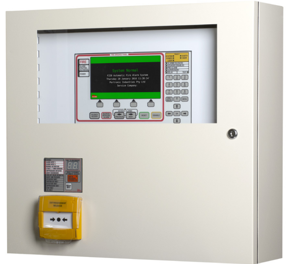
F220 Extinguishing Control Panel (F220-A10U/5A-ARC)

F220 Extinguishing Agent Release Panels are available in a range of cabinet sizes and styles, including weatherproof.