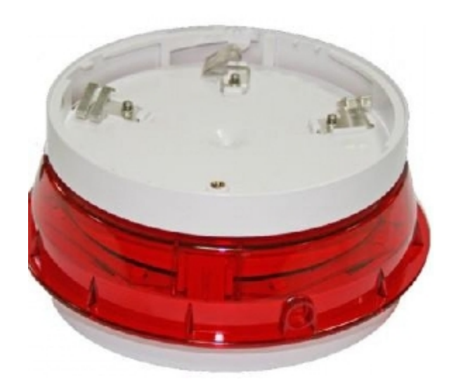
Addressable Detector Base Sounder Strobe BSS-DR-N34

The sounder/strobe is powered by the fire alarm control panel via the loop wiring. It is installed simply by a twist fit onto the B501AP base.